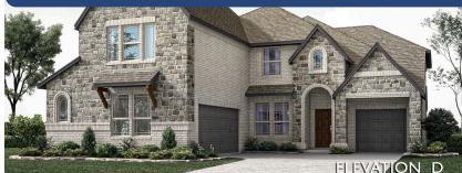
ELEVATION D (OPT MINI GARAGE)