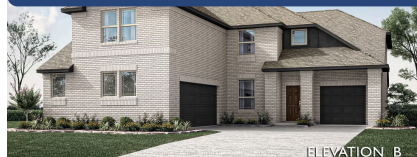
ELEVATION B (OPT MINI GARAGE)