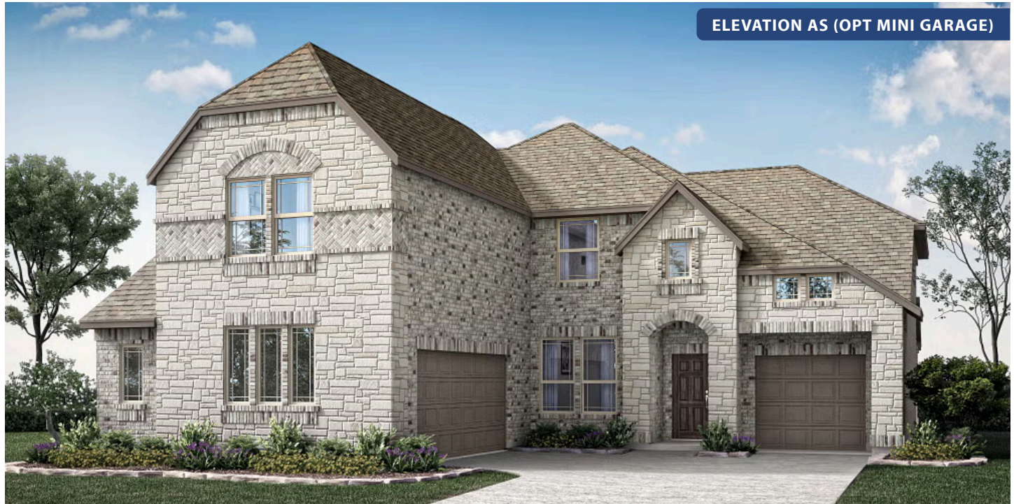
ELEVATION AS (OPT MINI GARAGE)