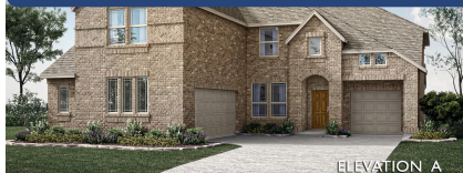
ELEVATION A (OPT MINI GARAGE)