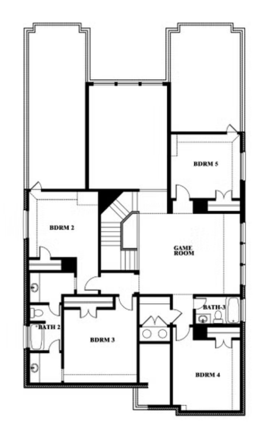
Rose III Opt. Bed & Bath at Study

This brochure is for general informational purposes and is to be used as a guide only. Changes may be made during the development process and floorplans, dimensions, fixtures, fittings, finishes and specifications are subject to change without notice. Window placement, balcony configuration, wardrobe sizes and living areas may vary slightly within each plan type. EQUAL HOUSING OPPORTUNITY.