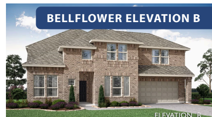
BELLFLOWER ELEVATION B