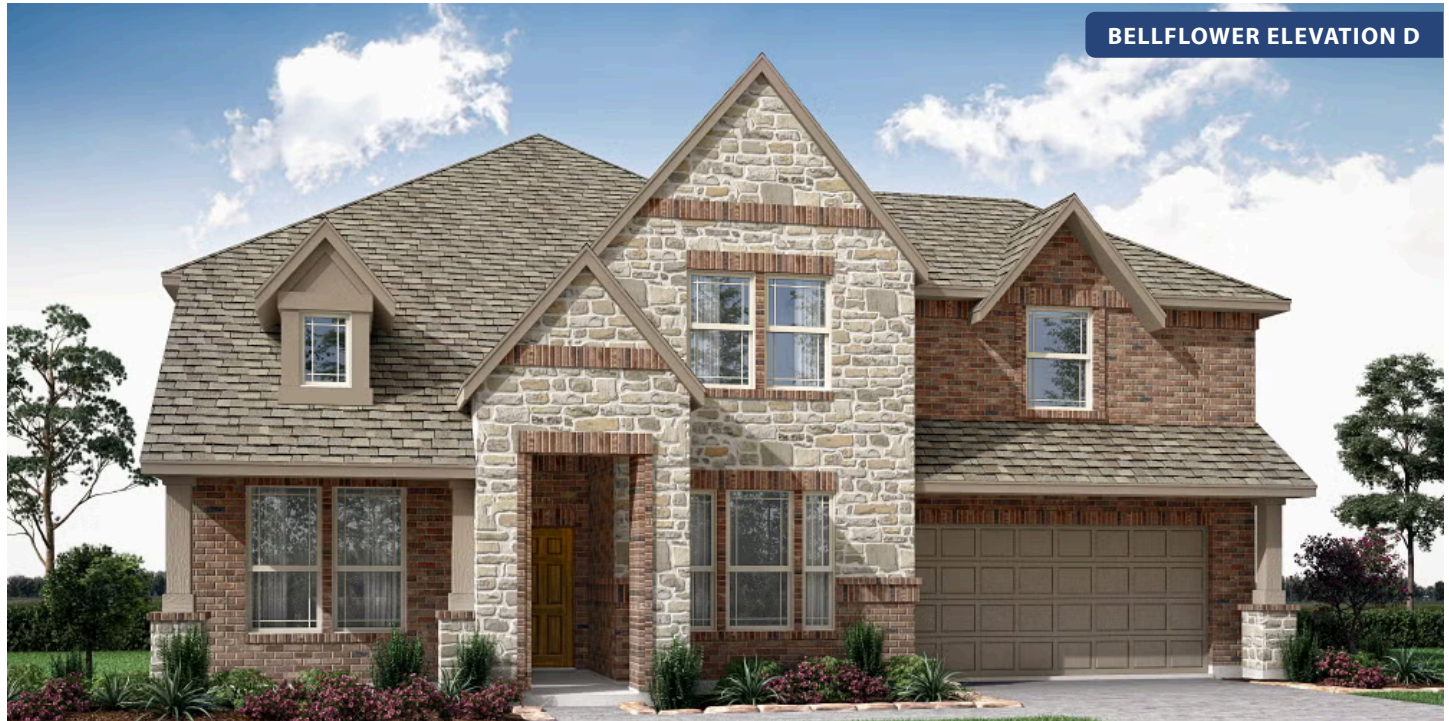
BELLFLOWER ELEVATION D