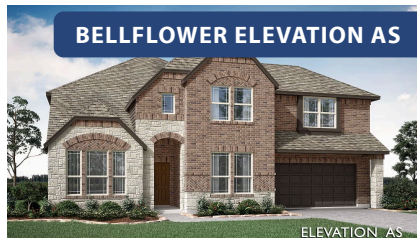
BELLFLOWER ELEVATION AS