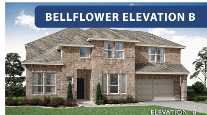
BELLFLOWER ELEVATION B