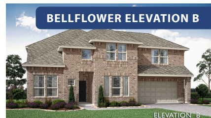
BELLFLOWER ELEVATION B