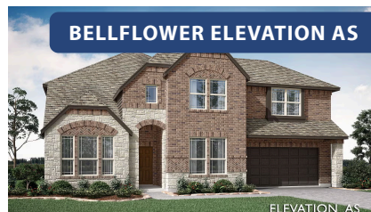
BELLFLOWER ELEVATION AS