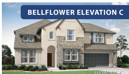
BELLFLOWER ELEVATION C