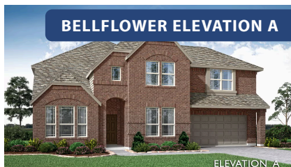
BELLFLOWER ELEVATION A