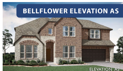
BELLFLOWER ELEVATION AS