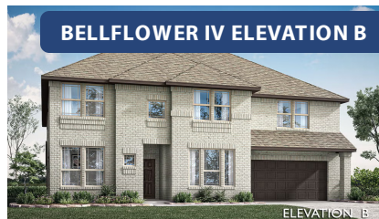
BELLFLOWER IV ELEVATION B