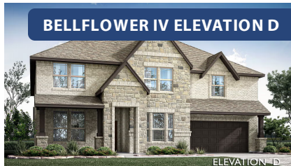
BELLFLOWER IV ELEVATION D