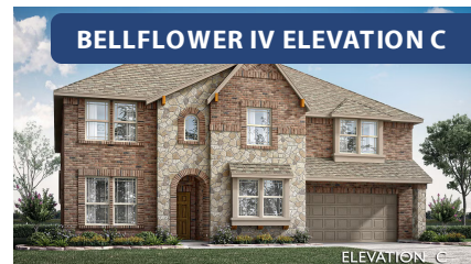
BELLFLOWER IV ELEVATION C