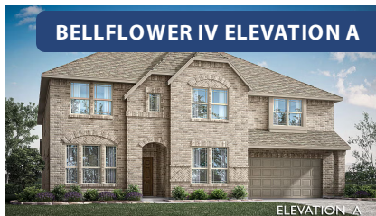
BELLFLOWER IV ELEVATION A