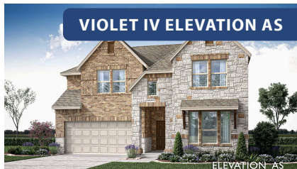
VIOLET IV ELEVATION AS