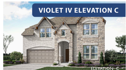
VIOLET IV ELEVATION C