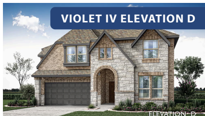
VIOLET IV ELEVATION D