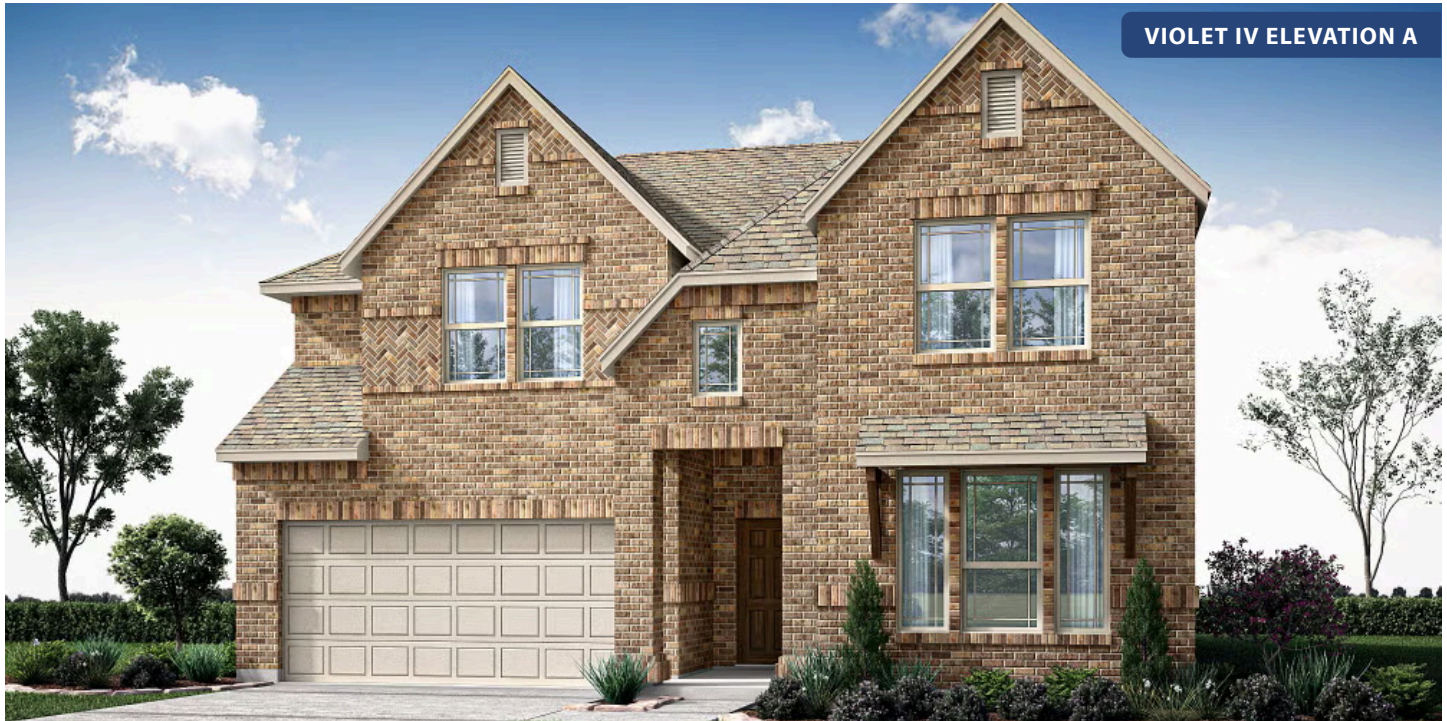
VIOLET IV ELEVATION A