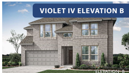
VIOLET IV ELEVATION B