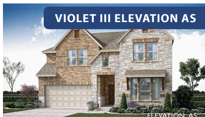
VIOLET III ELEVATION AS