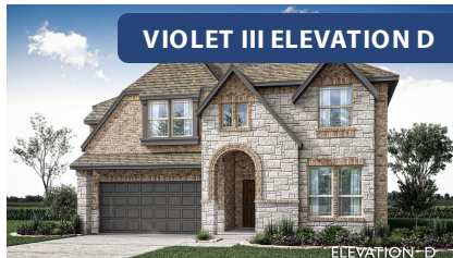
VIOLET III ELEVATION D