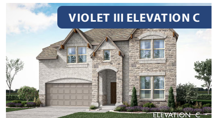
VIOLET III ELEVATION C