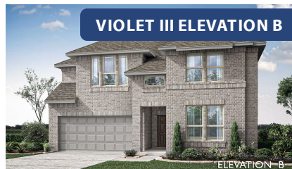
VIOLET III ELEVATION B