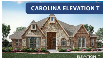
CAROLINA ELEVATION T