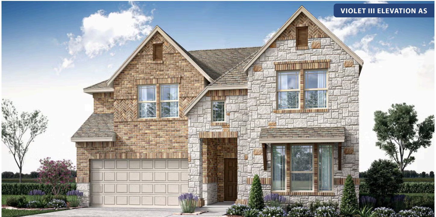
VIOLET III ELEVATION AS