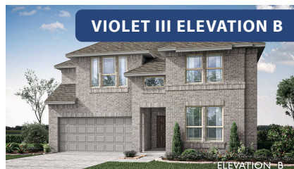
VIOLET III ELEVATION B