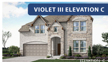
VIOLET III ELEVATION C