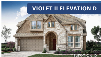
VIOLET II ELEVATION D