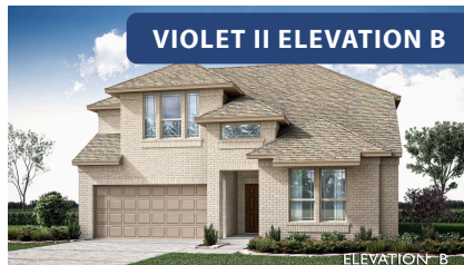
VIOLET II ELEVATION B