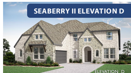
SEABERRY II ELEVATION D