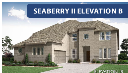
SEABERRY II ELEVATION B