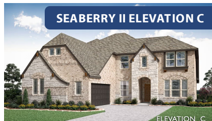
SEABERRY II ELEVATION C