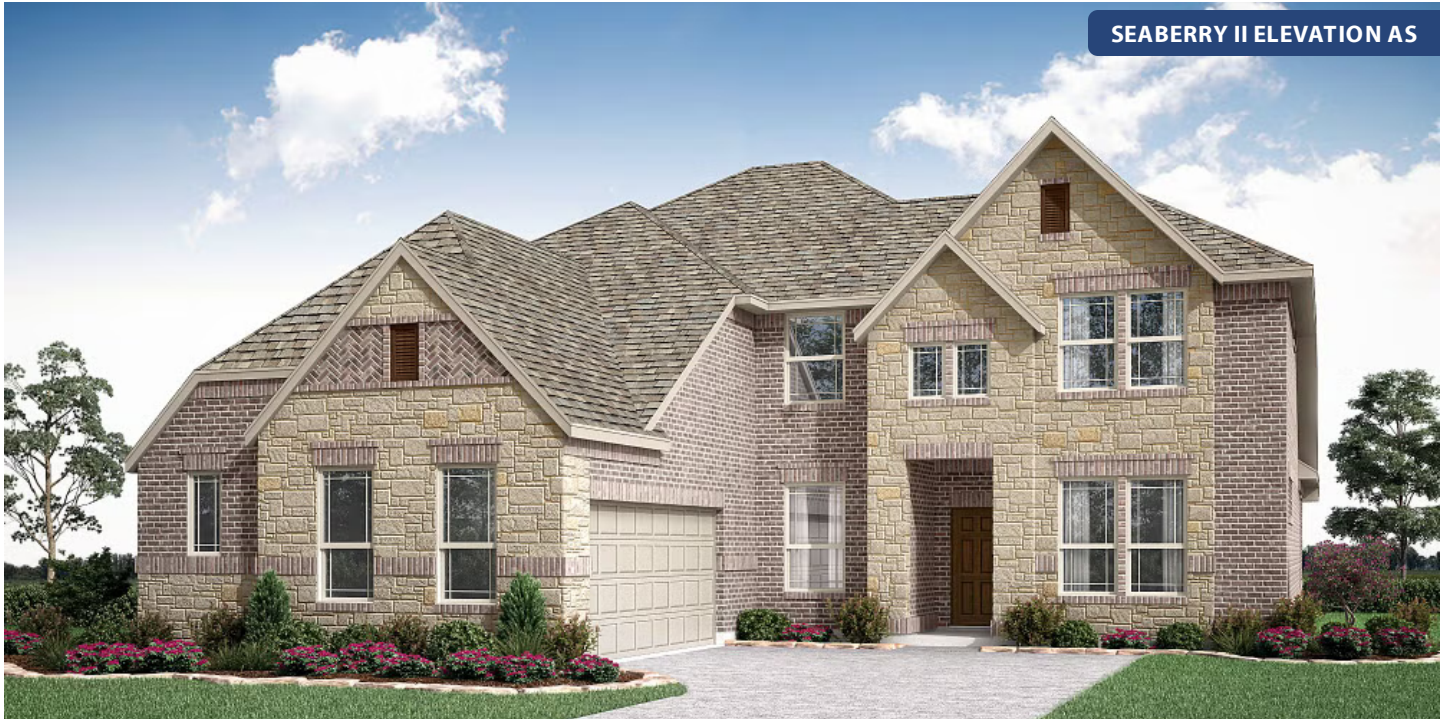
SEABERRY II ELEVATION A S