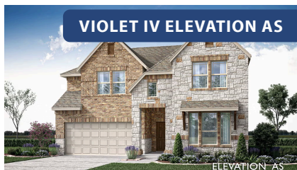
VIOLET IV ELEVATION AS