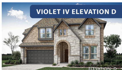
VIOLET IV ELEVATION D