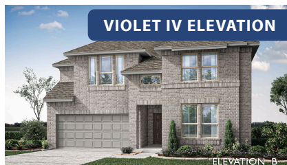
VIOLET IV ELEVATION B