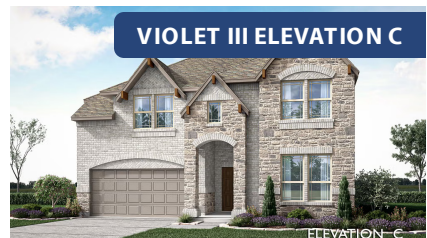
VIOLET III ELEVATION C