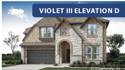
VIOLET III ELEVATION D