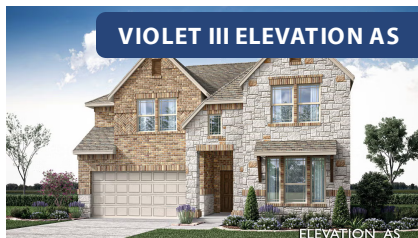
VIOLET III ELEVATION AS