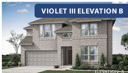
VIOLET III ELEVATION B