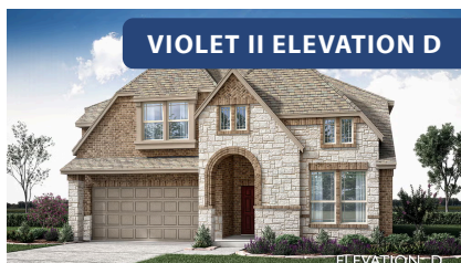
VIOLET II ELEVATION D