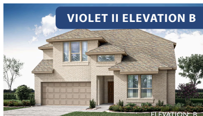
VIOLET II ELEVATION B