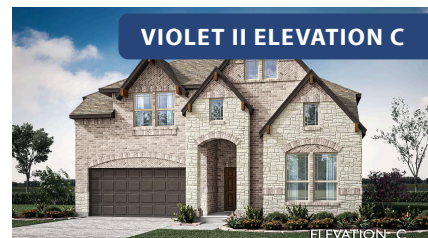
VIOLET II ELEVATION C