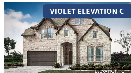
VIOLET ELEVATION C