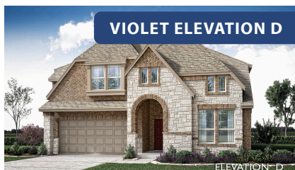
VIOLET ELEVATION D