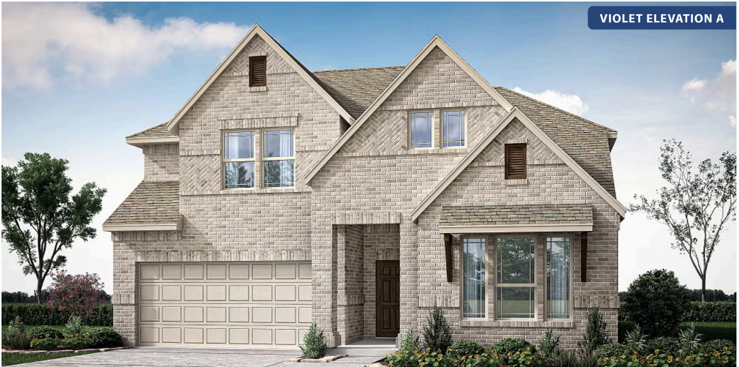
VIOLET ELEVATION A