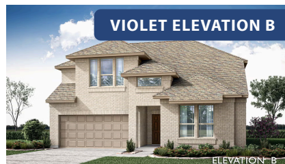
VIOLET ELEVATION B