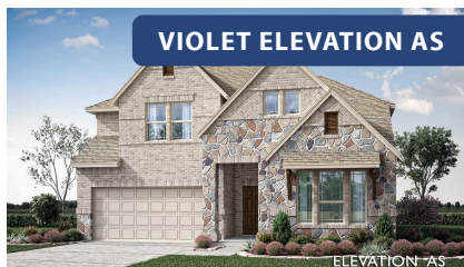
VIOLET ELEVATION AS