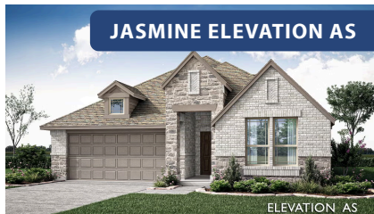
JASMINE ELEVATION AS