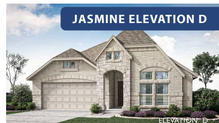
JASMINE ELEVATION D