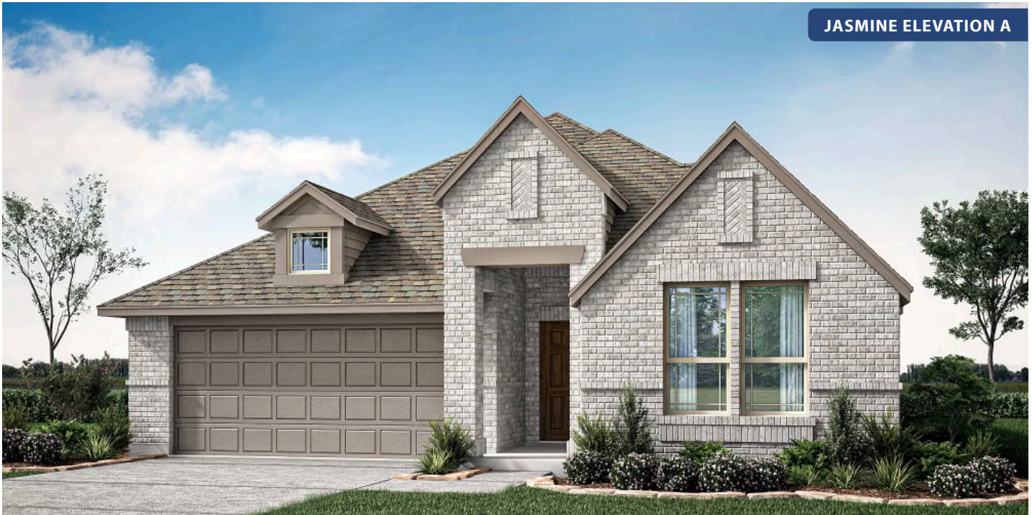
JASMINE ELEVATION A