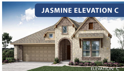
JASMINE ELEVATION C