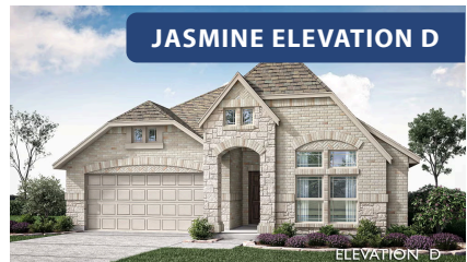
JASMINE ELEVATION D