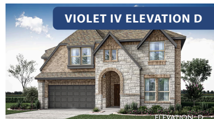
VIOLET IV ELEVATION D