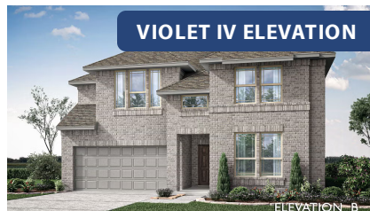
VIOLET IV ELEVATION B