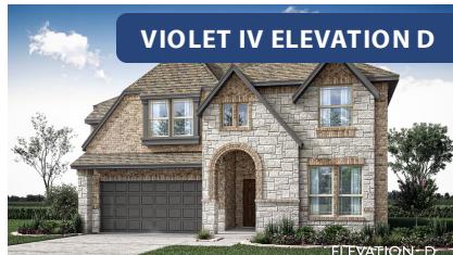
VIOLET IV ELEVATION D