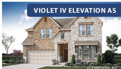
VIOLET IV ELEVATION AS