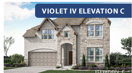
VIOLET IV ELEVATION C