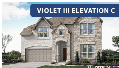
VIOLET III ELEVATION C