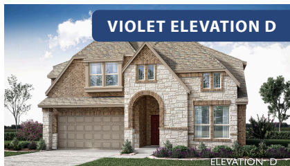
VIOLET ELEVATION D