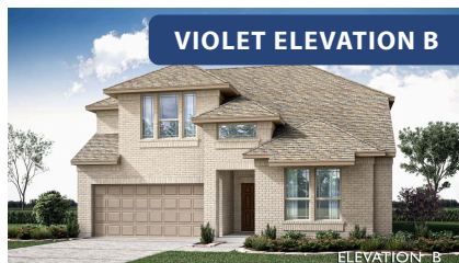
VIOLET ELEVATION B