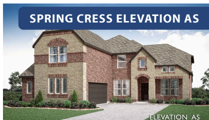
SPRING CRESS ELEVATION AS