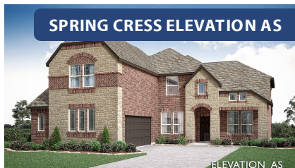
SPRING CRESS ELEVATION AS