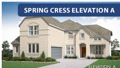
SPRING CRESS ELEVATION A