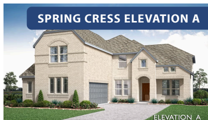
SPRING CRESS ELEVATION A