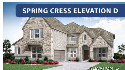
SPRING CRESS ELEVATION D