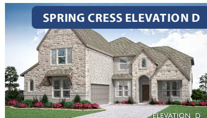
SPRING CRESS ELEVATION D