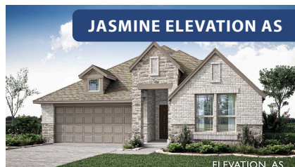
JASMINE ELEVATION AS