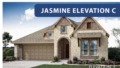
JASMINE ELEVATION C