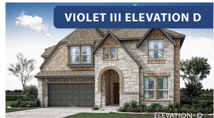
VIOLET III ELEVATION D