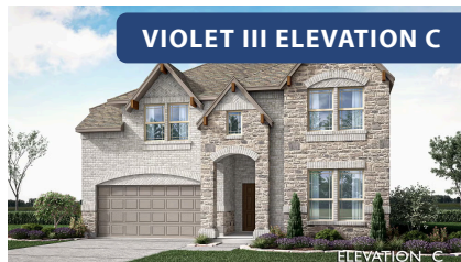
VIOLET III ELEVATION C