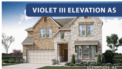
VIOLET III ELEVATION AS