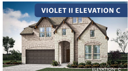
VIOLET II ELEVATION C