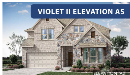
VIOLET II ELEVATION AS