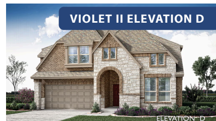
VIOLET II ELEVATION D