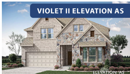
VIOLET II ELEVATION AS