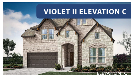
VIOLET II ELEVATION C