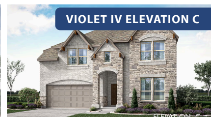
VIOLET IV ELEVATION C