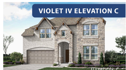
VIOLET IV ELEVATION C