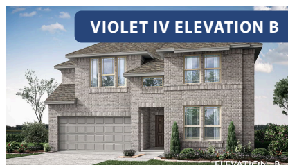
VIOLET IV ELEVATION B