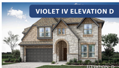
VIOLET IV ELEVATION D