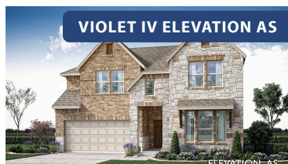
VIOLET IV ELEVATION AS