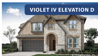
VIOLET IV ELEVATION D