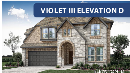
VIOLET III ELEVATION D