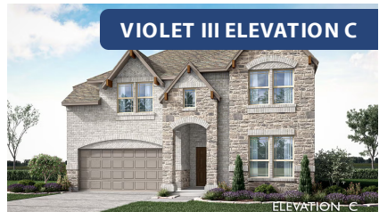
VIOLET III ELEVATION C