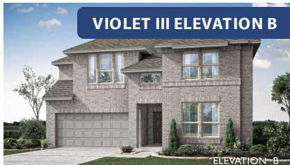
VIOLET III ELEVATION B