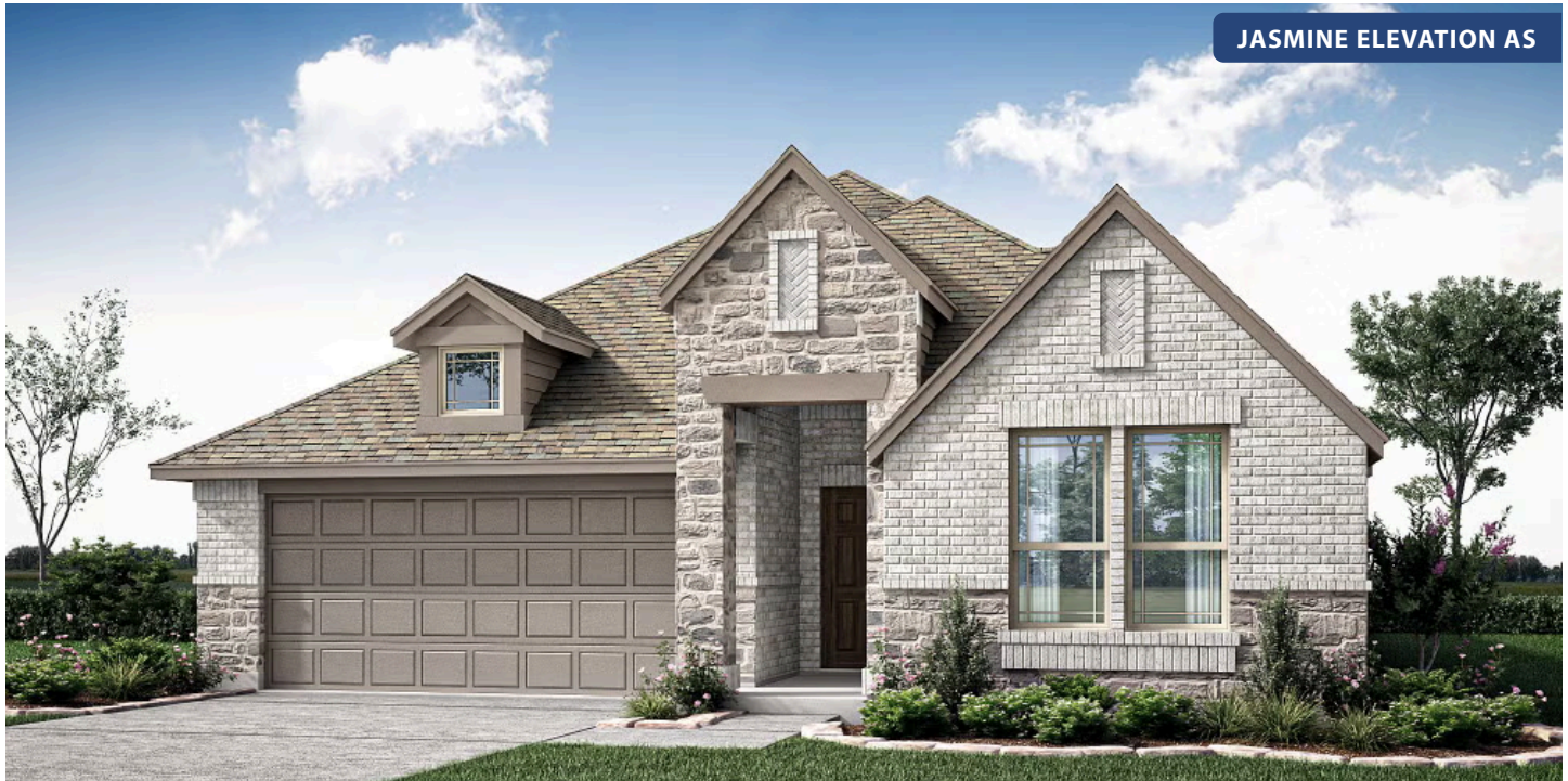
JASMINE ELEVATION A