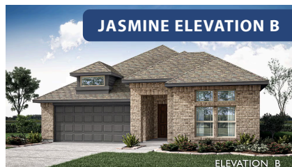
JASMINE ELEVATION B