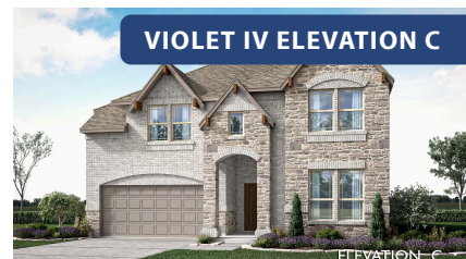
VIOLET IV ELEVATION C