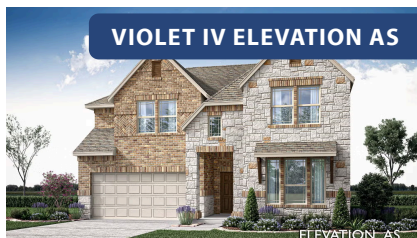
VIOLET IV ELEVATION AS