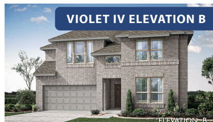
VIOLET IV ELEVATION B