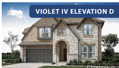
VIOLET IV ELEVATION D