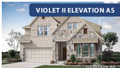
VIOLET II ELEVATION AS