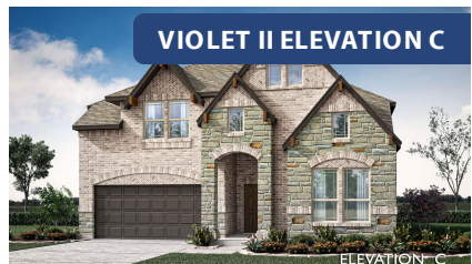
VIOLET II ELEVATION C