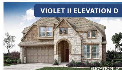
VIOLET II ELEVATION D