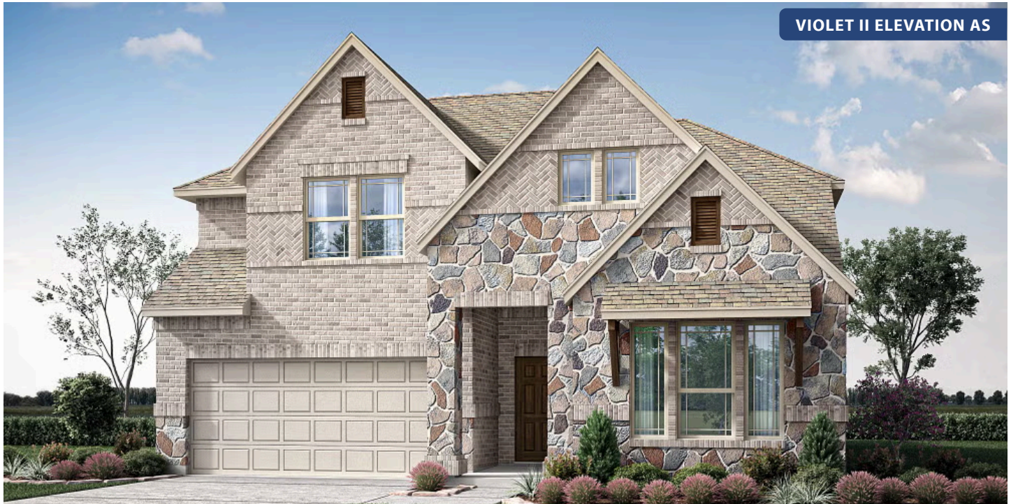
VIOLET II ELEVATION AS