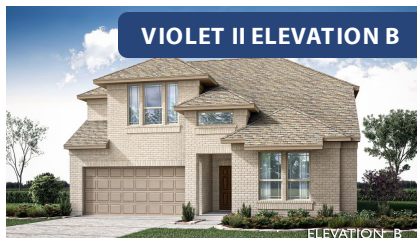
VIOLET II ELEVATION B