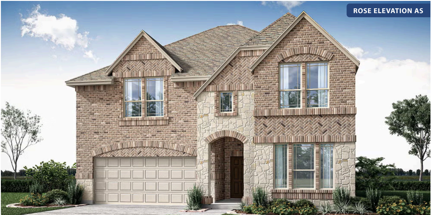
ROSE ELEVATION AS