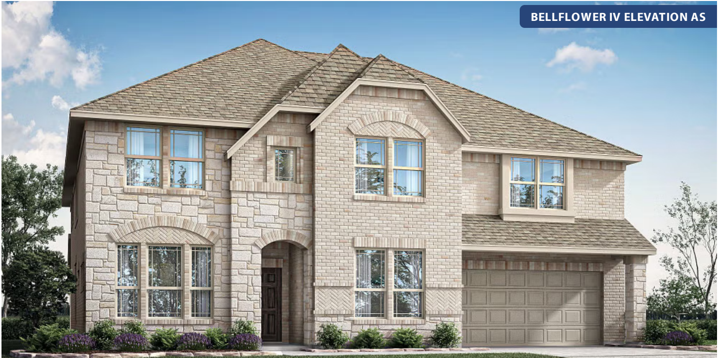
BELLFLOWER IV ELEVATION AS