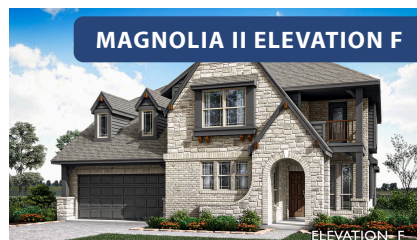
MAGNOLIA II ELEVATION F