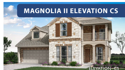
MAGNOLIA II ELEVATION CS