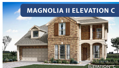
MAGNOLIA II ELEVATION C