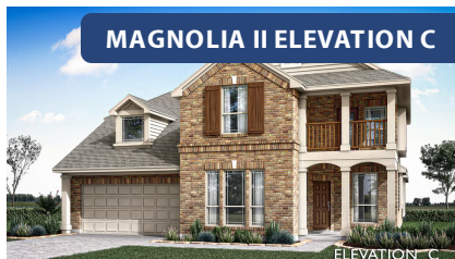
MAGNOLIA II ELEVATION C