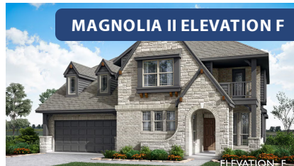
MAGNOLIA II ELEVATION F