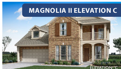
MAGNOLIA II ELEVATION C