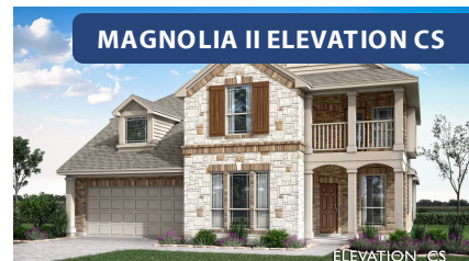
MAGNOLIA II ELEVATION CS