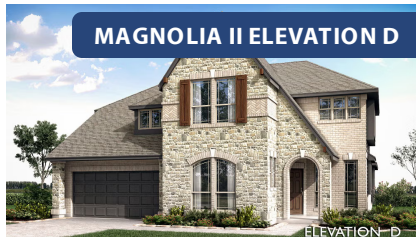
MAGNOLIA II ELEVATION D