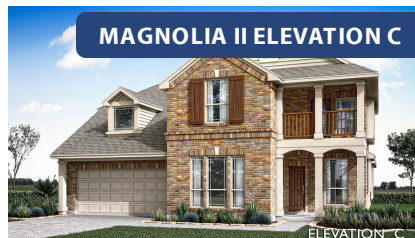
MAGNOLIA II ELEVATION C