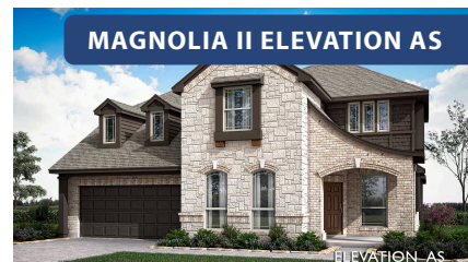
MAGNOLIA II ELEVATION AS