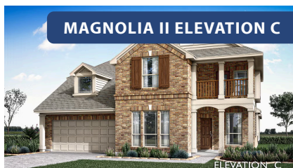
MAGNOLIA II ELEVATION C