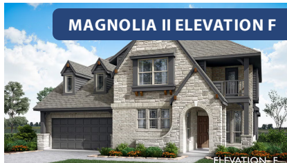
MAGNOLIA II ELEVATION F