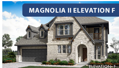
MAGNOLIA II ELEVATION F