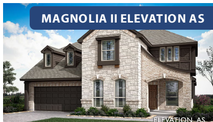
MAGNOLIA II ELEVATION AS