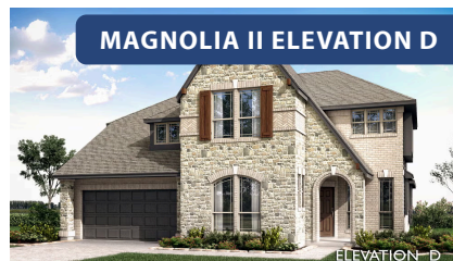
MAGNOLIA II ELEVATION D