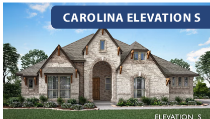
CAROLINA ELEVATION S