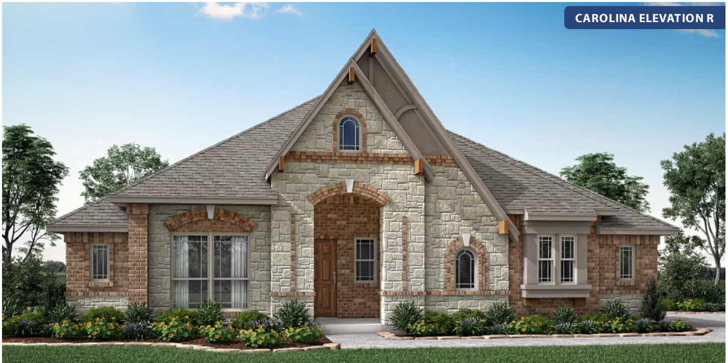
CAROLINA ELEVATION R