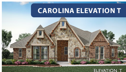
CAROLINA ELEVATION T